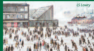
"And he painted matchstalk men and matchstalk cats and dogs..."