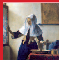
Young woman with a water pitcher by Vermeer

This is one of the most museum-laden cities on Earth and you have a dizzying array to choose from. The most famous are: the Metropolitan Museum of Art , Guggenheim Museum , Natural History , Brooklyn Museum , Frick Collection .